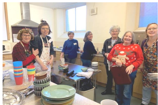
Masses of kitchen helpers at Pocklington Messy Church!